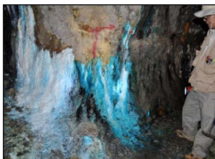
Mineralization at Cinco Senores