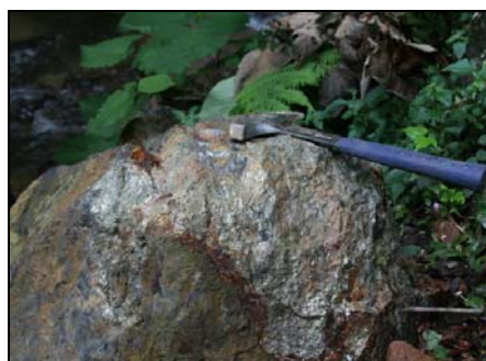
Mineralization at Cinco Senores