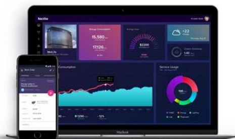
Facilio Energy Dashboard

"In my opinion, the more accurate view of our product is as a facilitating, monitoring and synergy generating platform, that transforms the passive operations of the previous generation of technologies into an interactive, agile and predictive iteration of themselves. The basis of our approach is not to replace but to transform existing automation, by unlocking potential." - Prabhu Ramachandran